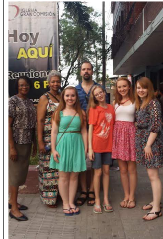
Christian Assembly Team